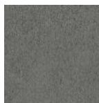
Concrete Dark grey 3964006