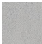
Concrete Cool grey 3964007