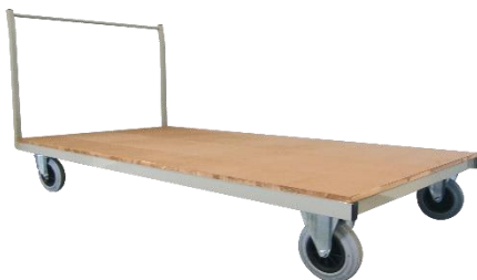
Protectiles trolley 1568001