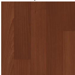
Figure 1 - Omnisport Compact flooring illustration

Product description: Omnisports product provides ideal innovative floorings for young athletes and children. For them, performance and pleasure should be their only concern. Omnisports floorings meet the highest environmental and health standards allowing. The service lifetime recommended by Tarkett is 20 years.