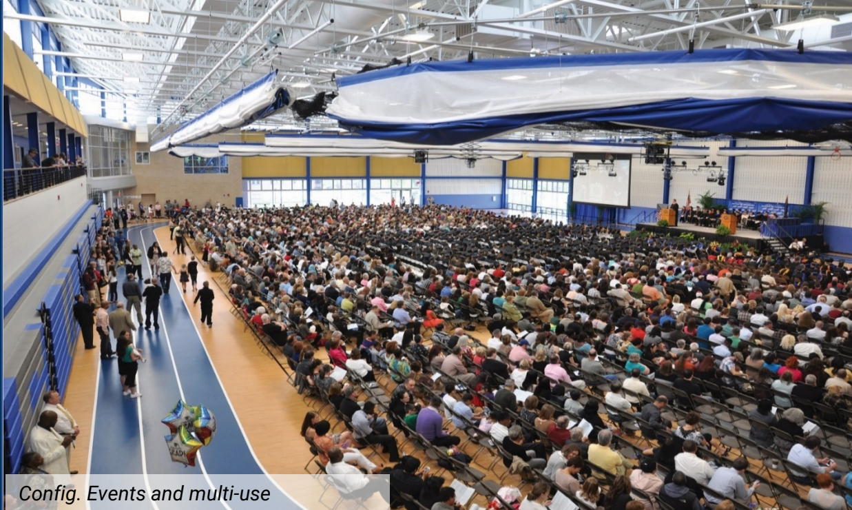
Config. Events and multi-use

Omnisports Reference Multi-use (6.2mm) combines the performance required for multi-sport practice with static and rolling load resistance.